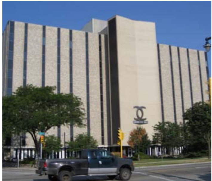
The former Eaton Corp. research building re-birthed as Century City Tower in Milwaukee's 30th Street Industrial Corridor. The building houses M-WERC's energy, power and controls accelerator, the Energy Innovation Center (EIC).

Like the Water Council, M-WERC plans to operate an industry-specific business accelerator and research labs. However unlike the Global Water Center's trendy digs adjacent to downtown Milwaukee, M-WERC's accelerator will be housed in the recently vacated former headquarters of Eaton Corporation's Milwaukee division in the city's rather desolate and isolated 30th Street Industrial Corridor. The corridor, buoyantly rebranded as "Century City," was at one time a major tentacle of the