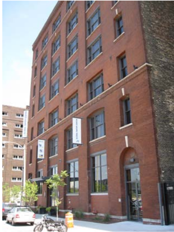
The Global Water Center located on the edge of Milwaukee's Third Ward warehouse district.

An historic outgrowth of Milwaukee's 20th century "beer to gears" economy (and the city's later concern with fixing its recurrent problems with accidental sewage discharges into Lake Michigan) was the growth of numerous smaller companies involved in the purification, filtration, conservation, testing, treatment, pumping, and metering of water.